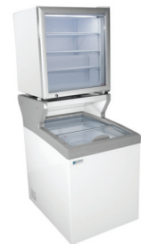
Combo MCT-2HC with 1 optional CTF-3HC