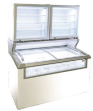
Double Combo-MCT-4HC with 2 optional CTF-3HC