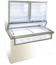
Double Combo-MCT-4HC with 2 optional CTF-3HC