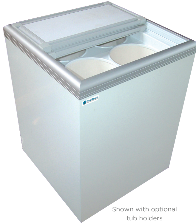
Shown with optional tub holders