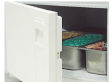
Additional storage compartment