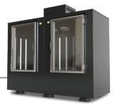
Gelo i100 Glass Door Black