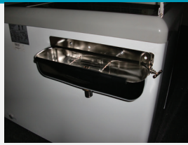
Optional Dipper Well