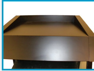
Product display shelf